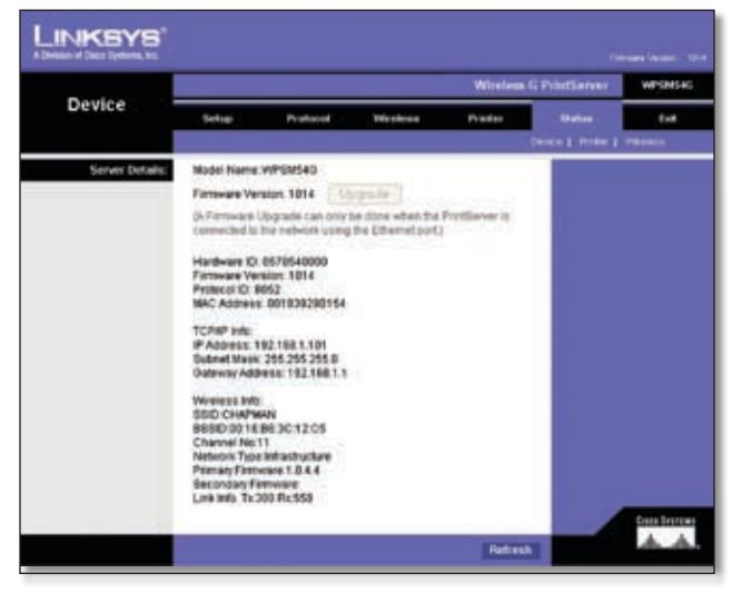
Status > Device - Server Details

Upgrade A firmware upgrade can only be performed when the PrintServer is connected to the network using its Ethernet port. If you want to upgrade the PrintServer's firmware, follow these instructions: